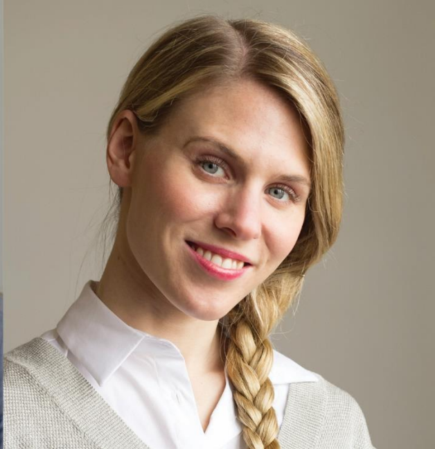
Project and Communications Manager